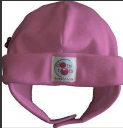
Photos: Products for the new baby & mom Dots on Tots

A 100% all natural baby headwear company providing safety and comfort to children ages newborn through toddler stage. Perfect for newborns through toddler stage, Dots on Tots hats will keep children safe, comfortable and healthy as they grow. Specific styles are also available for children with sensitive ears. (Hats begin at $25.00 and are available at the Dots on Tots web site.)